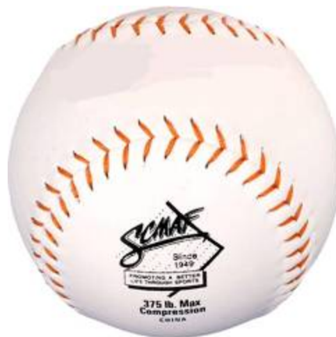
Example of a SCMAF Stamped Softball