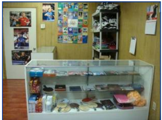
LATTA Pro Shop

If you are interested in hosting a table tennis tournament for your association/agency or want to learn or see the LATTA facility, you can find it at www.latabletennis.com or to visit and meet with Tawny: 10180 Valley Blvd., El Monte, CA 91731 (behind the El Monte car wash).