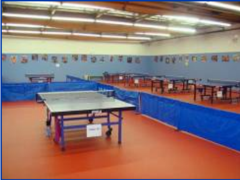
Inside the LATTA Facility

SCMAF: What makes your facility unique from other table tennis facilities?