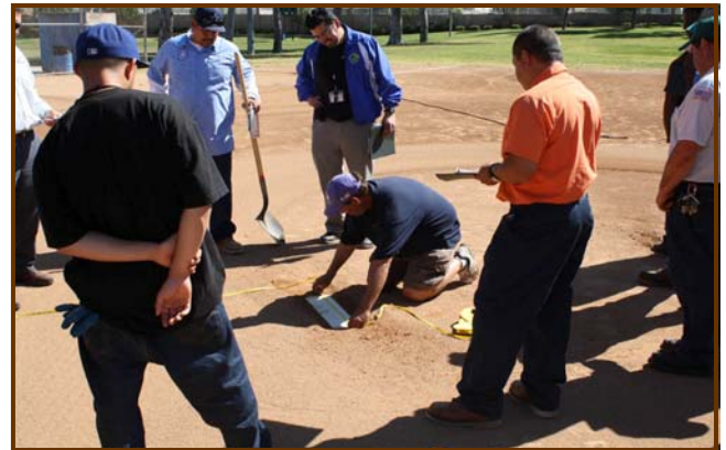
2010 SCMAF Turf and Ball Field Management Workshop

Approximately 110 attendees representing agencies from across the Southland benefited from the expertise of the Home Depot Center staff. In addition, ball field maintenance and preparation specialists from Major League Softball conducted an informative field prep clinic at nearby Stevenson Park in Carson.